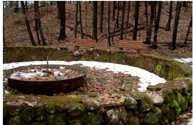
ruins of the electrified fountain