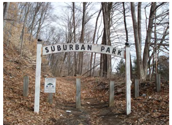
sign at Park Pond Place