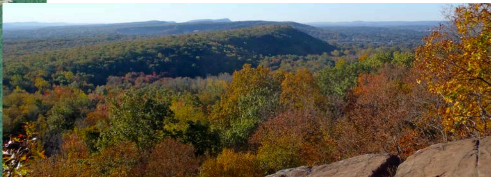
Rattlesnake Cliffs southern view from the Metacomet Ridge of the Hanging Hills in Meriden.