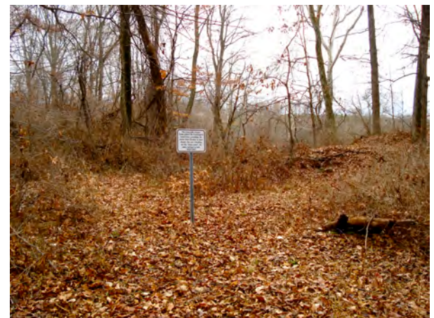
trail sign at the canal junction