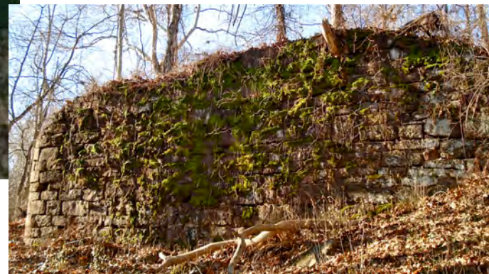
Farmington Aqueduct's west abutment