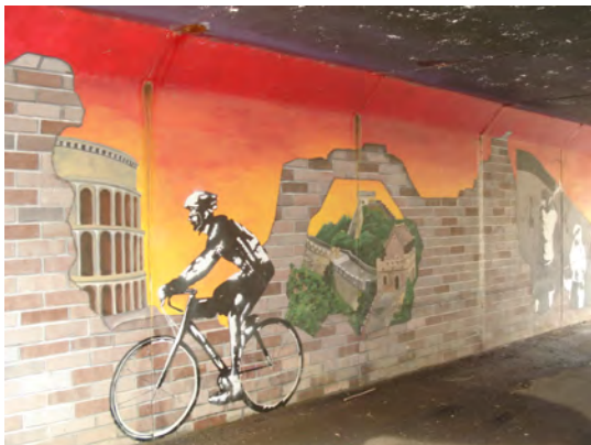
Unionville's Trail #1's Artist Tunnel