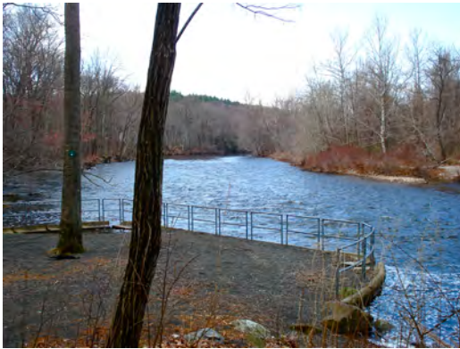
Unionville's fishing pier