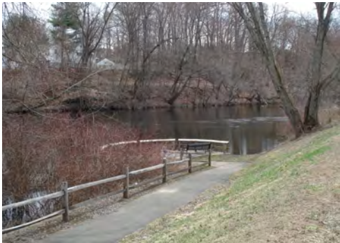
Farmington's fishing pier